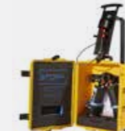
Extended Reach Breathing Apparatus System