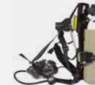
BA Escape Set