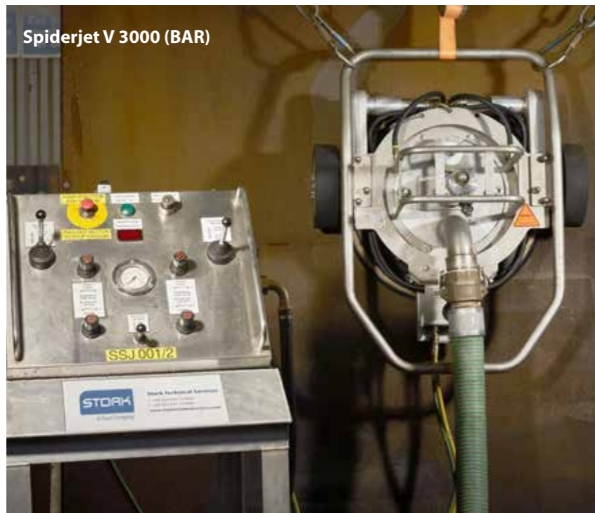
Spiderjet V 3000 (BAR)

The Spiderjet V (Vacuum) 3000 surface preparation system forms part of our comprehensive range of jetting equipment for the maintenance and repair of assets. Ideally suited for tank/ship hull surface preparation scopes.