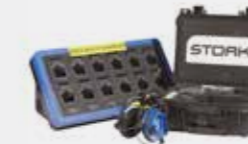
Litecome Pro Headset