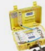
Air Purity Analyser