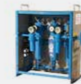
ALG 10 Breathing Air System