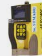
Air Purity Analyser

Our extensive fleet of cordless, 110v and pneumatic hand tools from market leading brands such as Dewalt, Makita, Monti, Hilti, Universal Tool and Trelawny. They consist of drills, shears, saws, impact wrenches, needle guns, breakers, Bristle Blaster and grinder/sanders.