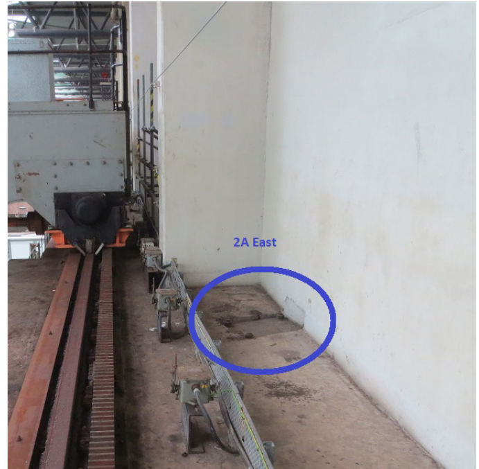
Location of the tie rods

The results of the inspection allowed our client to make a critical decision on the suitability of these hangers to support the gas ducts until they were decommissioned.